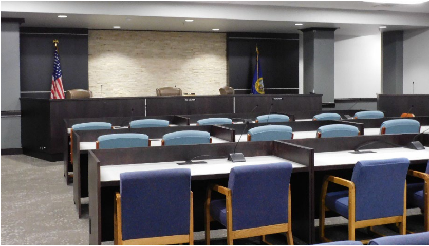
PUC hearing room

There are technical hearings and customer hearings . At technical hearings, formal parties who have been granted “intervenor status” present testimony and evidence, subject to cross-examination by attorneys from the other parties, Commission Staff attorneys and the Commissioners. At customer hearings, members of the public may testify before the Commission.