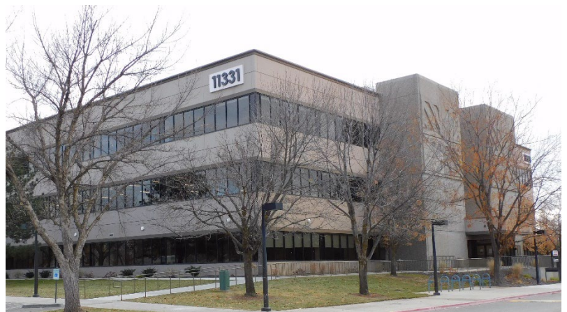
PUC headquarters 11331 W. Chinden Blvd. Building 8, Suite 201-A, Boise, Idaho 83714.

Decision meetings consist of the Commission’s review of decision memoranda prepared by Commission Staff (Staff). Minutes of the meetings are taken. Decisions reached at these meetings may be either final or preliminary, but subsequently become final when the Commission issues a written order signed by a majority of the Commission. Under the Idaho Open Meeting Law, Commissioners may also privately deliberate fully submitted matters.